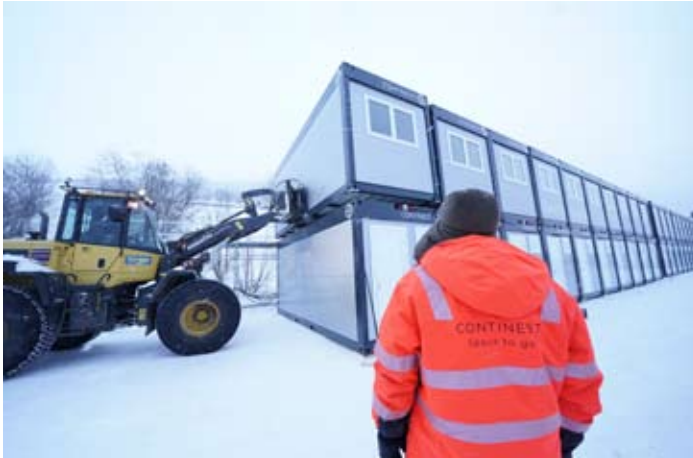
FIS Alpine World Ski Championship 2019, Åre (Sweden)