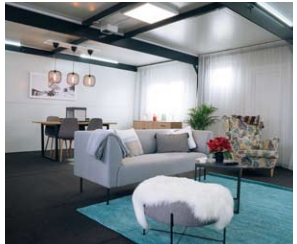
The Showman's Show 2019 (UK)