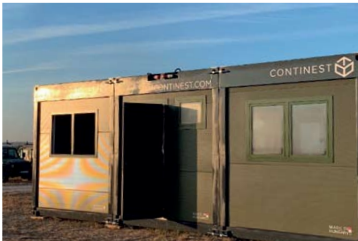
Brave Warrior 2020 multinational exercise (H)