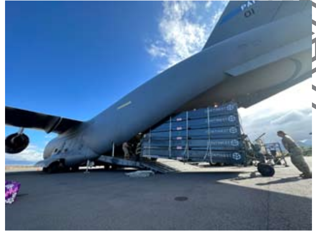
Delivering Shelters to Hawaii 2023 (US)